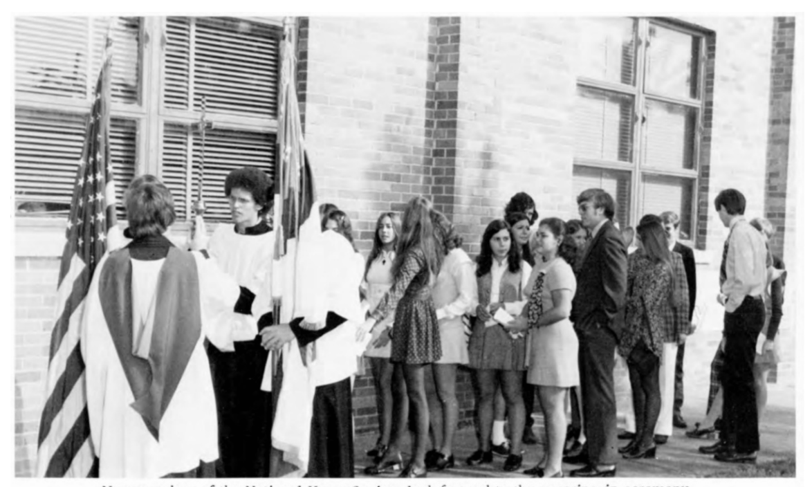
New members of the National Honor Society look forward to the swearing-in ceremony.