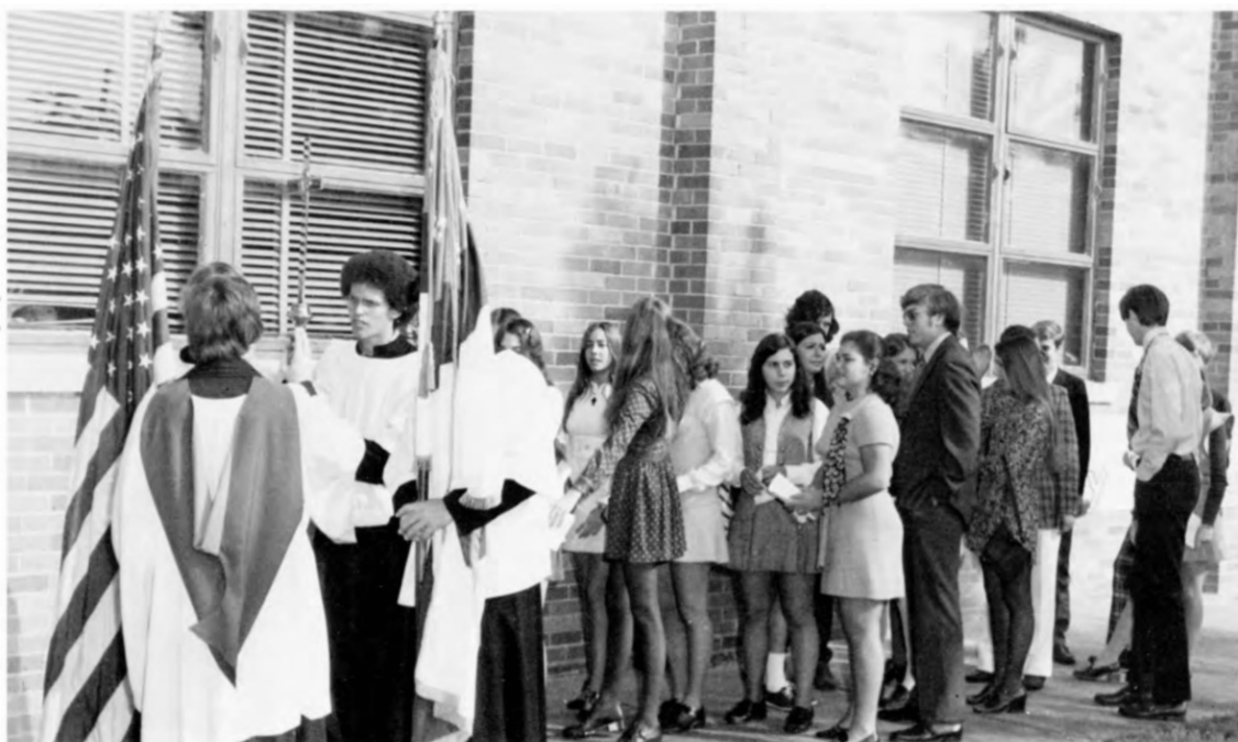
New members of the National Honor Society look forward to the swearing-in ceremony.